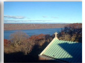
Bon Secours NY/Schervier Academy

The 315-mile Hudson River flows through eastern New York, southward past the state capital at Albany until it reaches New York City, before emptying into Upper New York Bay. It's natural beauty is inspiring and one of Riverdale's most defining features. The proposed Hudson River Greenway will open two miles of new waterfront access in the Bronx and an additional one mile of access in Yonkers. Here's what community leaders are saying about the greenway and the proposed Hudson River Greenway Project.