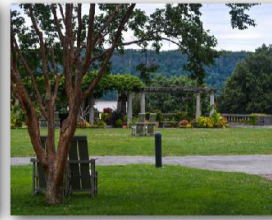
Wave Hill (Public Garden and Cultural Center)