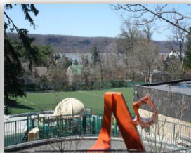
Salanter Akiba Riverdale Academy