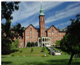
College of Mount Saint Vincent and Sisters of Charity