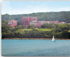
Hebrew Home at Riverdale