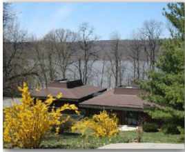
Leake & Watts

A Special Natural Area District next to the Hudson River