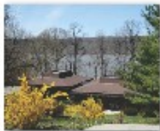
Leake & Watts

A Special Natural Area District next to the Hudson River