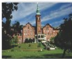
College of Mount Saint Vincent and Sisters of Charity