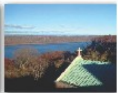
Salanter Akiba Riverdale Academy Riverdale Country School Bon Secours NY/Schervier

The 315-mile Hudson River flows through eastern New York, southward past the state capital at Albany until it reaches New York City, before emptying into Upper New York Bay. It's natural beauty is inspiring and one of Riverdale's most defining features. Here's what the community is saying about the greenway and the proposed Hudson River Greenway Project.