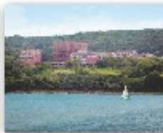
Hebrew Home at Riverdale