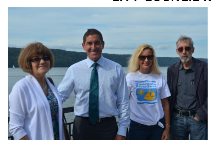
The Hudson River Greenway in the Bronx moved a few steps closer to reality with several important developments.