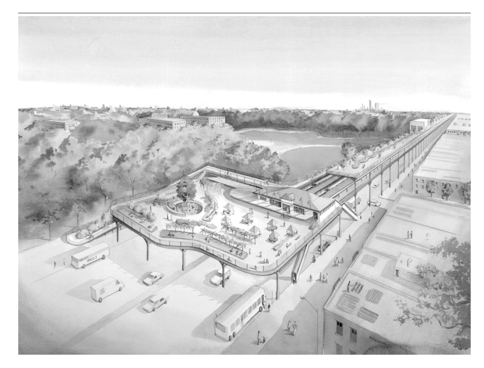
Green Elevated Train Proposal

KRVC is pleased to be working with John's Botany Bay this spring to beautify the South Riverdale commercial corridors with tree pit plantings. We are also excited about our new Broadway in the Bronx beautification proposals, which include a Green Elevated Train proposal, an Albany Crescent Plaza proposal and so much more. krvcdc.org/broadway