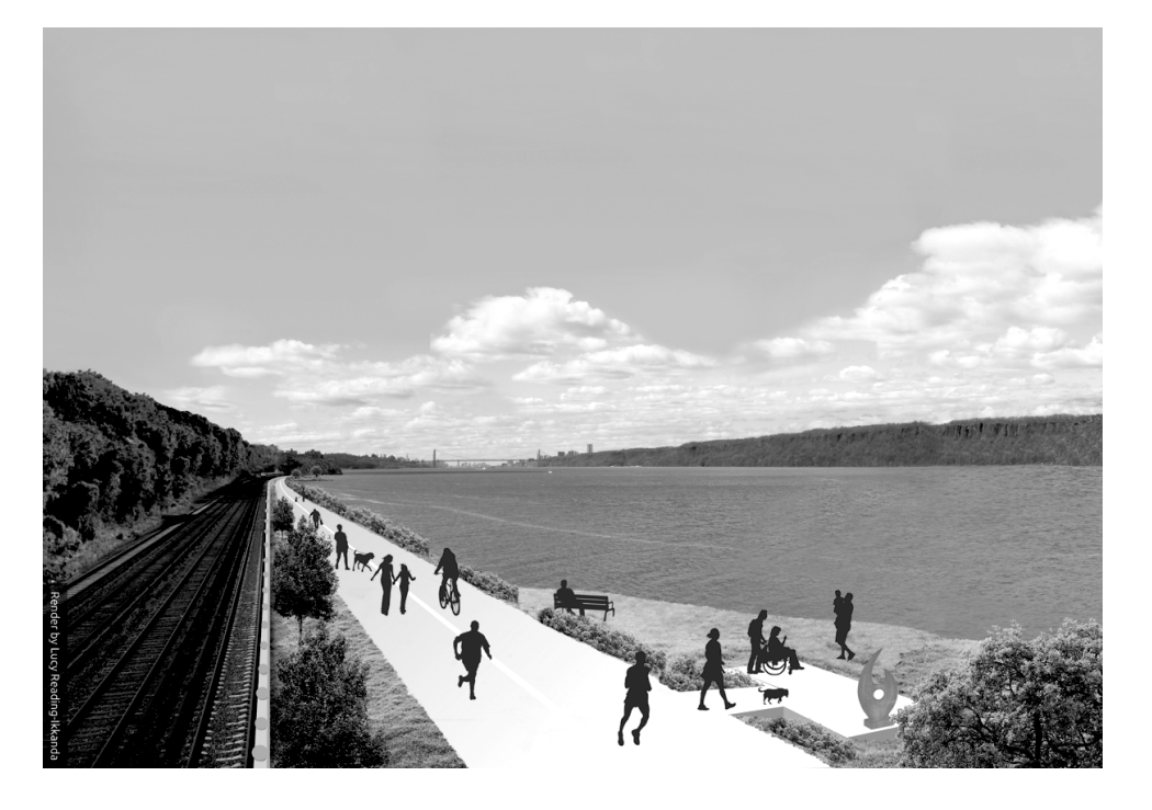
Hudson River Greenway Proposal for the Bronx

KRVC is pleased to be working with John's Botany Bay this spring to beautify the South Riverdale commercial corridors with tree pit plantings. We are also excited about our Hudson River Greenway Initiative. We hope to see real progress on this development proposal that would bring so much to our community. Get us to the river NOW! krvcdc.org/greenway