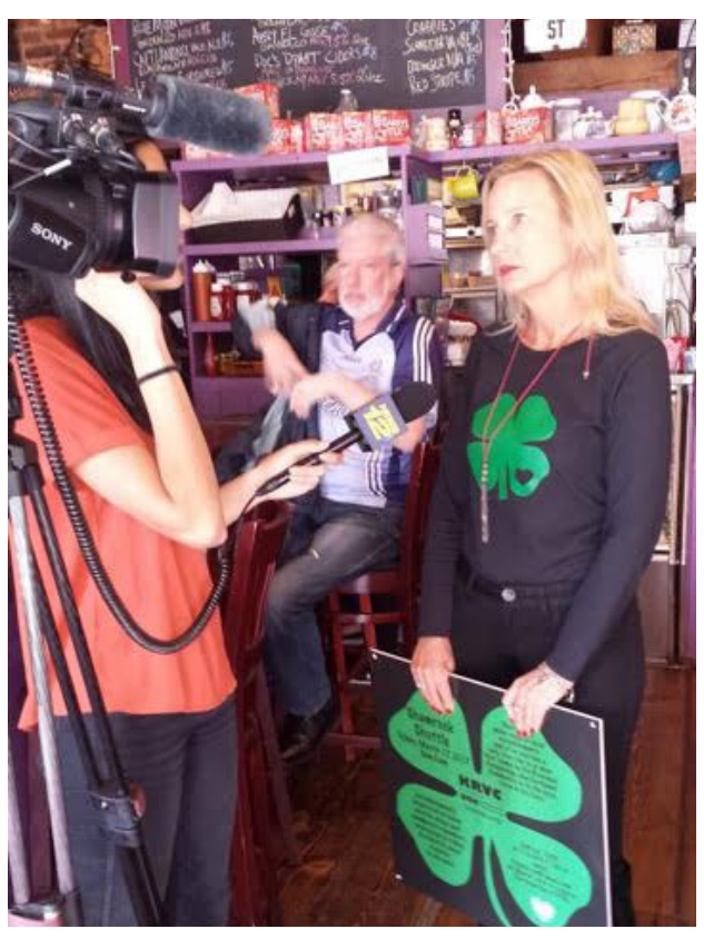
KRVC's Executive Director was interviewed by News 12 at the Club KRVC Oscars Party on February 26th and on March 8th to promote the upcoming Shamrock Shuttle.