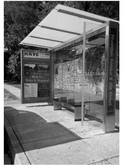
A bus shelter ad at 256th St. and Riverdale Ave.

To make this happen the Association needs the help of the community. Easy ways to get involved: contacting elected officials, submitting comments to and/or attending meetings of the North Riverdale Merchants Association, and Community Board 8. For more information visit the "Riverdale, Smart Growth Plan" website at: riverdalebronx.nyc . KRVC encourages everyone to get involved for the good and betterment of our homes and community. •