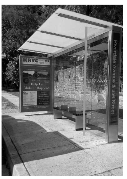
A bus shelter ad at 256th St. and Riverdale Ave.

To make this happen the Association needs the help of the community. Easy ways to get involved: contacting elected officials, submitting comments to and/or attending meetings of the North Riverdale Merchants Association, and Community Board 8. For more information visit the "Riverdale.